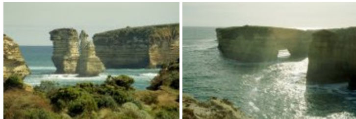
ABOVE: Two Views of Port Campbell National Park