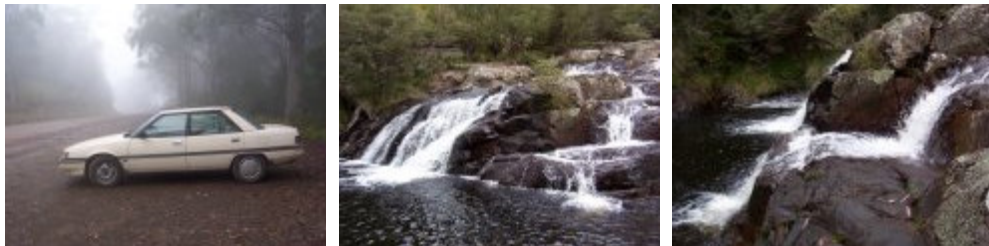
ABOVE: My car at Moppy Picnic Area; Views of Polblue Creek Falls