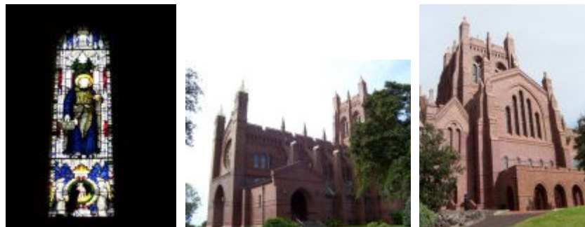
ABOVE: Newcastle's Christ's Church Cathedral (Anglican)