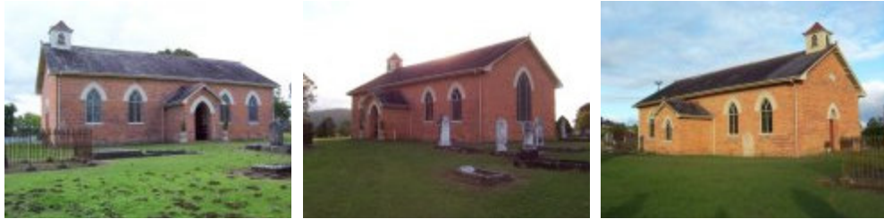
ABOVE: Various views of Stroud's Anglican Church