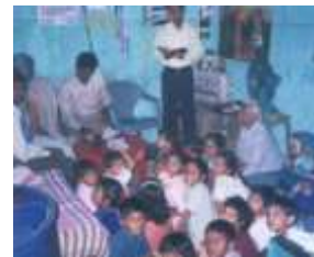
ABOVE AND ABOVE RIGHT: Various photos of the ministry of Truth Reformed Baptist Church.