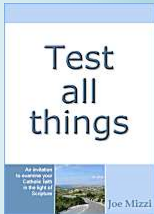
ABOVE: Test all Things by Joe Mizzi – available on the home page