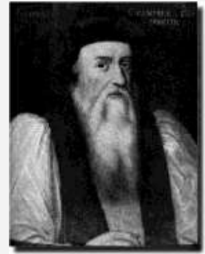
ABOVE: Thomas Cranmer