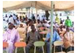
ABOVE: Various photos from the work in Ghana

“Consider becoming partners in the gospel with them, whether that be through financial assistance or spiritual assistance.”